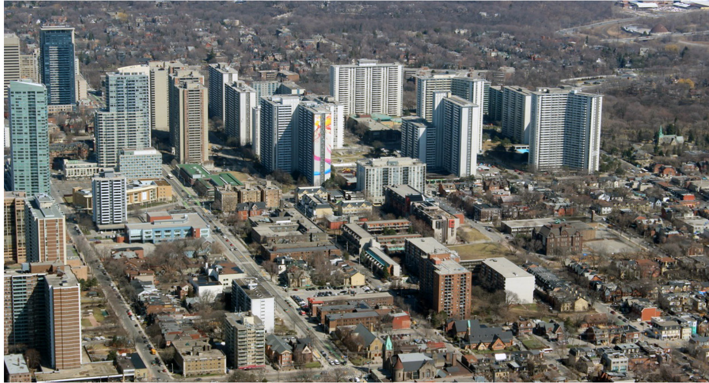
St. James Town's worlds tallest mural