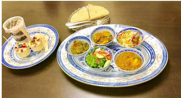
One of many Flavours from our Neighbours prepared meals

Flavours from Our Neighbours partnered with The City of Toronto for the ‘Love Food Hate Waste Campaign’ aimed at reducing food waste. Flavours from Our Neighbours , along with celebrity Chef Bob Blumer created meals using rescued food.