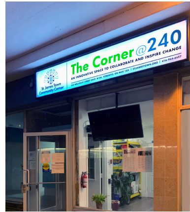
The Corner@240 #108 – 240 Wellesley Street East Toronto, ON M4X 1G5 [r] 416-964-6657 Ext: 240

Advocacy through civic engagement has always been an important part of The Corner’s work. In collaboration with residents and the Service Providers Network a petition was delivered to The City to designate St. James Town a Neighbourhood Improvement Area. This has significance for funding and other resource allocation. Residents and service providers worked hard together to meet deadlines and fulfill the requirements for this submission.